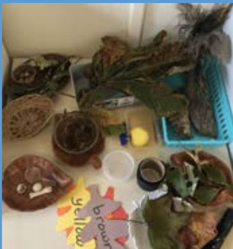
The children's Nature Table