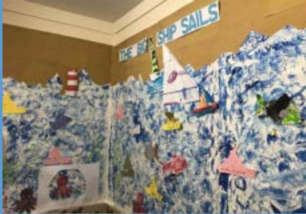
Sea Mural created with children's help